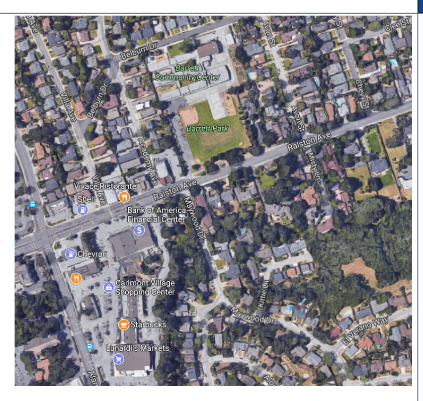
Barrett Community Center

Members in Belmont and San Carlos or nearby go directly to the Barret Community Public Parking Lot.