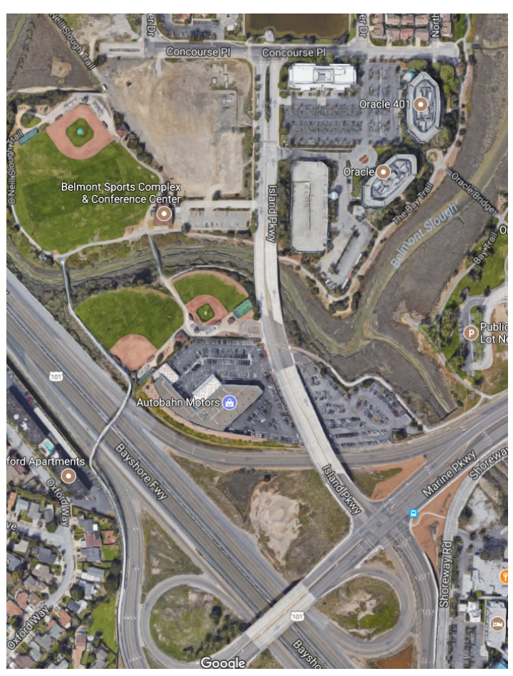
Sport Complex Area